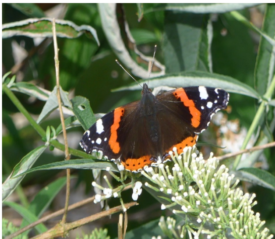
Red Admiral