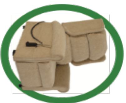
Rise & Recline Chairs