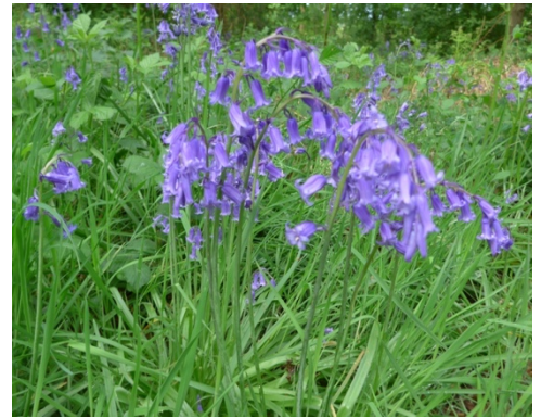
Bluebells by Robin Johnson

Happy Mondays lunch – two delicious hot courses for just £5 – do book ahead with a quick phone call. Turkey is on the menu for 14th April.