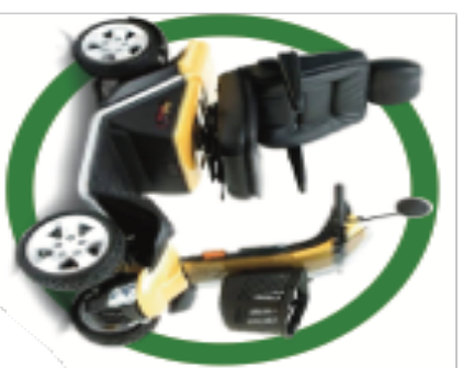
Scooters & Wheelchairs