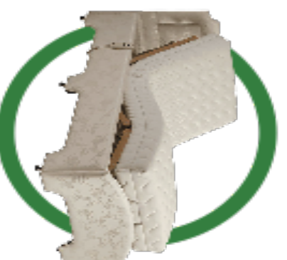
Custom Made Adjustable Beds

Call Us On 24hrs Answer-phone 01263588777