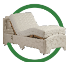
Custom Made Adjustable Beds

Call Us On 24hrs Answer-phone 01263588777