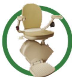
Stair Lifts & Bath Lifts