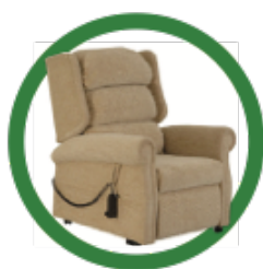
Rise & Recline Chairs