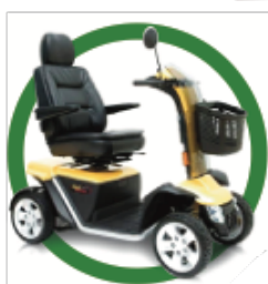
Scooters & Wheelchairs