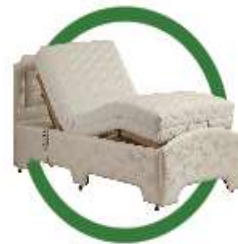
Custom Made Adjustable Beds

Call Us On 24hrs Answer-phone 01263588777