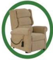
Rise & Recline Chairs