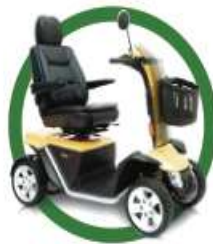
Scooters & Wheelchairs