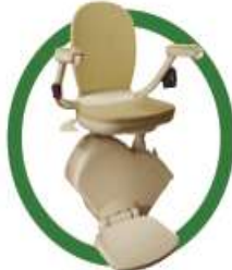
Stair Lifts & Bath Lifts