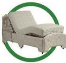
Custom Made Adjustable Beds