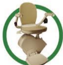
Stair Lifts & Bath Lifts