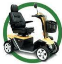
Scooters & Wheelchairs