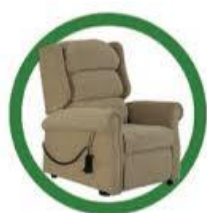
Rise & Recline Chairs