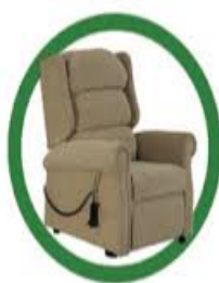
Rise & Recline Chairs