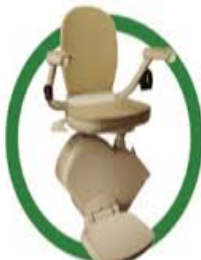
Stair Lifts & Bath Lifts