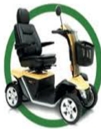
Scooters & Wheelchairs