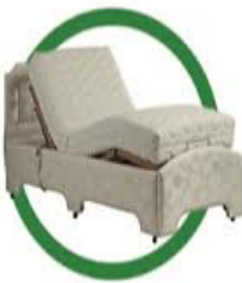
Custom Made Adjustable Beds