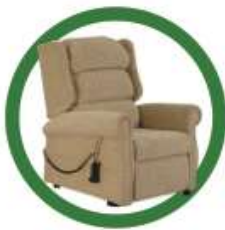
Rise & Recline Chairs