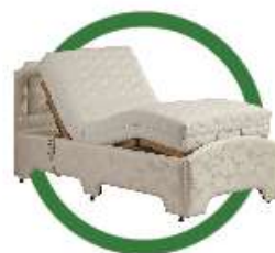
Custom Made Adjustable Beds

Call Us On 24hrs Answer-phone 01263588777