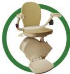
Stair Lifts & Bath Lifts