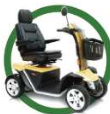
Scoters & Wheelchairs